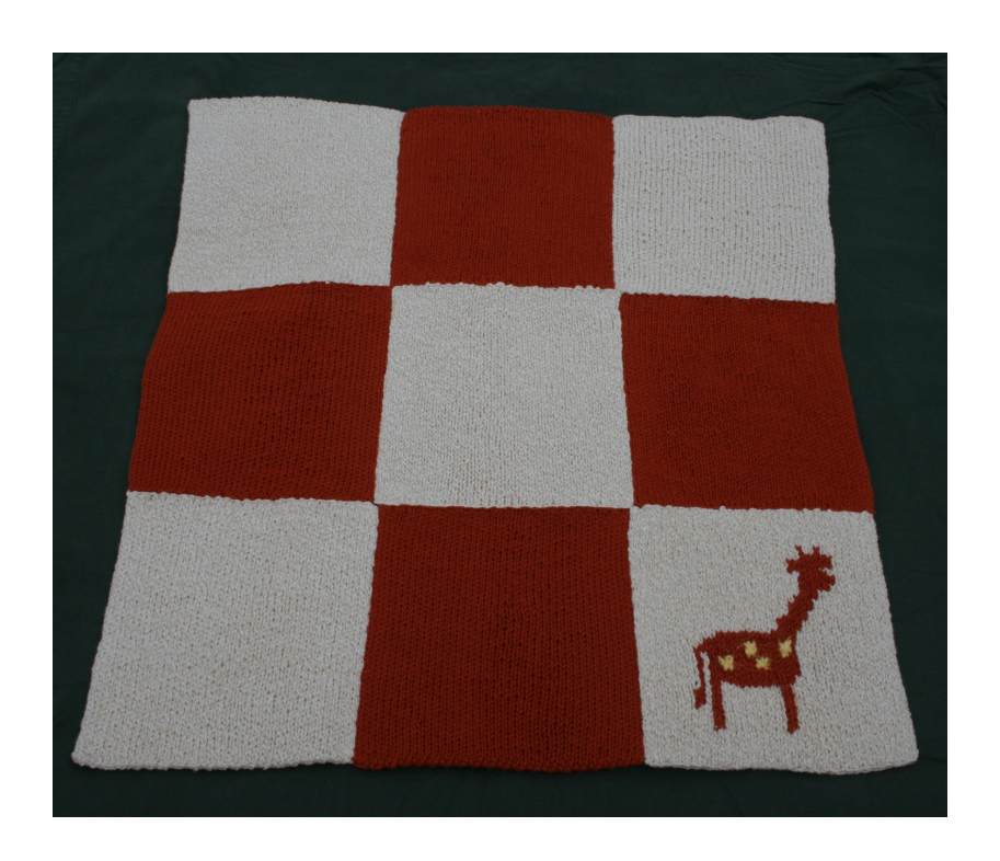
Giraffe Baby Blanket

I really hope you enjoy knitting this up!